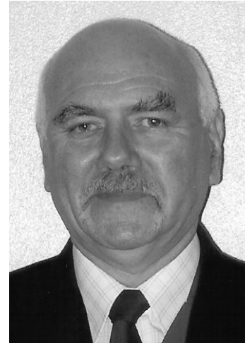
Melbourne Diocese Council.