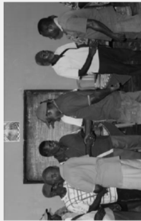
Elders from both tribes shake hands after the ceremony and commit to 'everlasting peace'